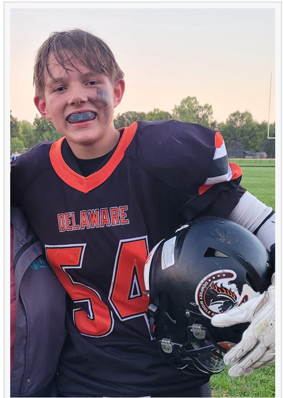
Young players mom loves the concussion reducing protection of XSport Carbon Fiber mouthguards