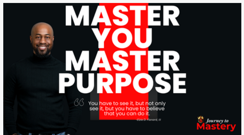
Master You. Mastery Purpose.