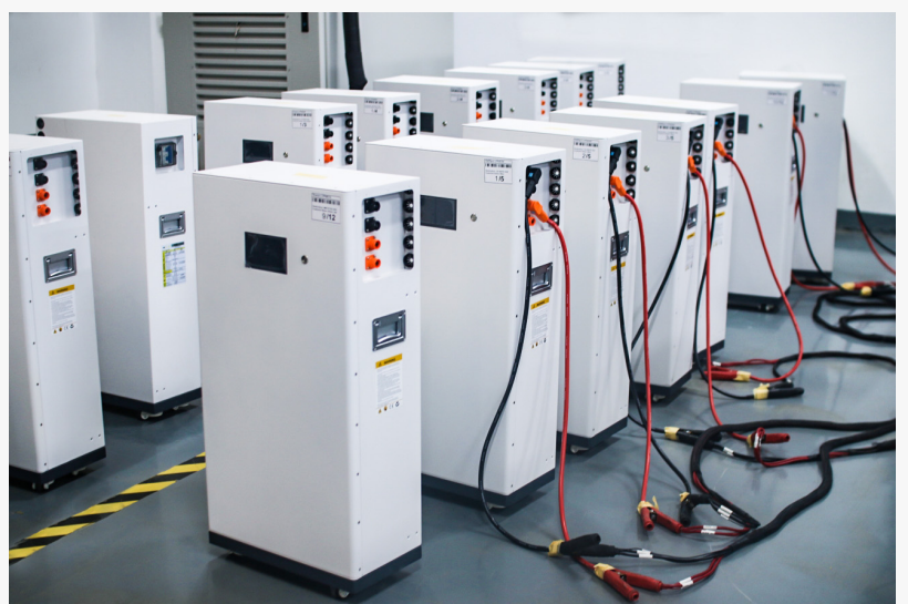
15KWH Lithium battery production

EGbatt is excited to announce a limited-time promotion offering its 15kWh Lithium Battery Storage Solution at a special price of $1480. This high-performance battery is designed to upgrade solar systems, providing reliable, sustainable, and cost-effective energy storage for off-grid applications, homes, cabins, and small businesses.