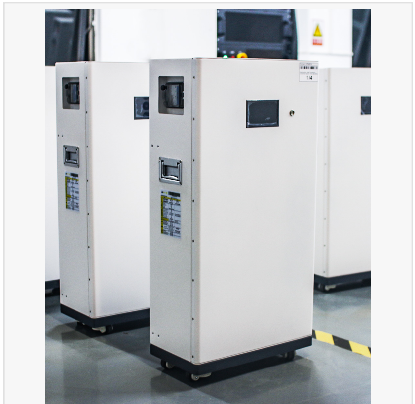
48v 300Ah LiFePo4 battery storage

About EGbatt EGbatt is an innovative provider of energy storage solutions specializing in lithium batteries and off-grid inverters. The company's mission is to make renewable energy more efficient, affordable, and accessible by offering high-quality products that help customers enhance their