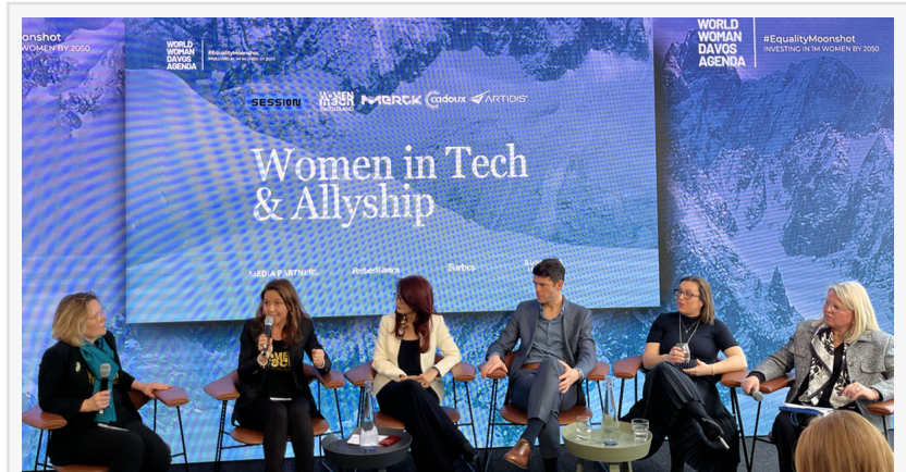
Women in Tech and Allyship at the World Woman Davos Agenda 2024

BASEL, BASEL-STADT, SWITZERLAND, January 9, 2025 /EINPresswire.com/ -- Women in Tech Switzerland has officially joined as a strategic partner for the 3rd Edition of the World Woman Davos Agenda . Women in Tech Switzerland will host a pivotal session on “Leadership in Innovation, Diversity, and Resilience” on January 22, 2025, at 1:45 PM at the Hotel Mountain Plaza, Davos.