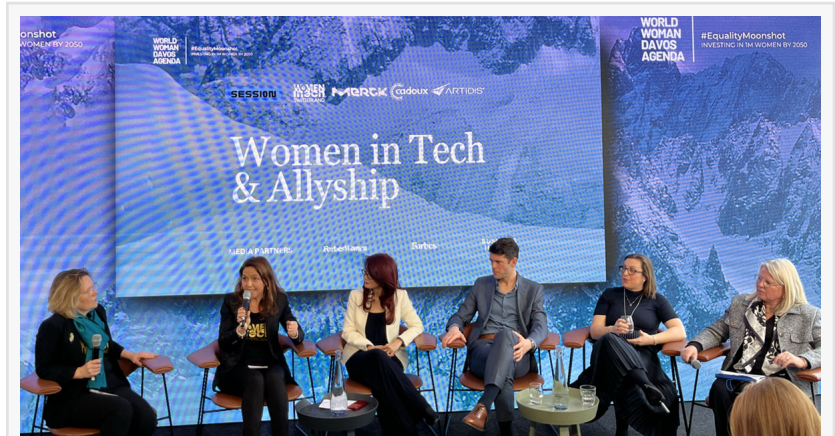
Women in Tech and Allyship at the World Woman Davos Agenda 2024

BASEL, BASEL-STADT, SWITZERLAND, January 9, 2025 /EINPresswire.com/ -- Women in Tech Switzerland has officially joined as a strategic partner for the 3rd Edition of the World Woman Davos Agenda . Women in Tech Switzerland will host a pivotal session on “Leadership in Innovation, Diversity, and Resilience” on January 22, 2025, at 1:30 PM at the Hotel Mountain Plaza, Davos.