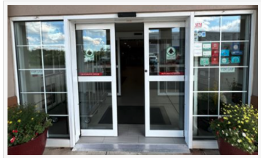
Automatic doors smoothly sliding open, ensuring seamless entry and exit

• Touchless Automatic Doors: Ideal for high-traffic areas, providing effortless entry for all users.