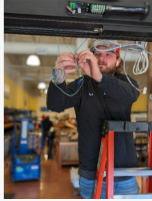
A technician expertly repairing the wiring of an automatic door to ensure reliable functionality