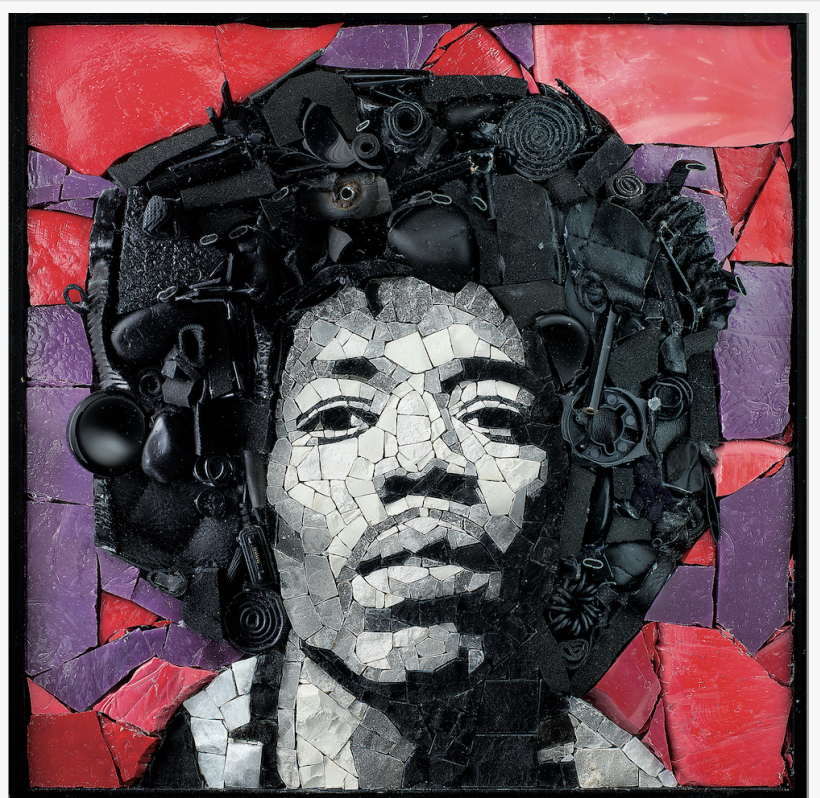
Jimmy H - Mosaics at Cornell Art Museum

Competition) from the prestigious Scuola Mosaicisti del Friuli, a world-famous mosaic school, created the initiative to support young artists and offer them international recognition to assist them during the difficult period of transition from the world of school to the world of work.