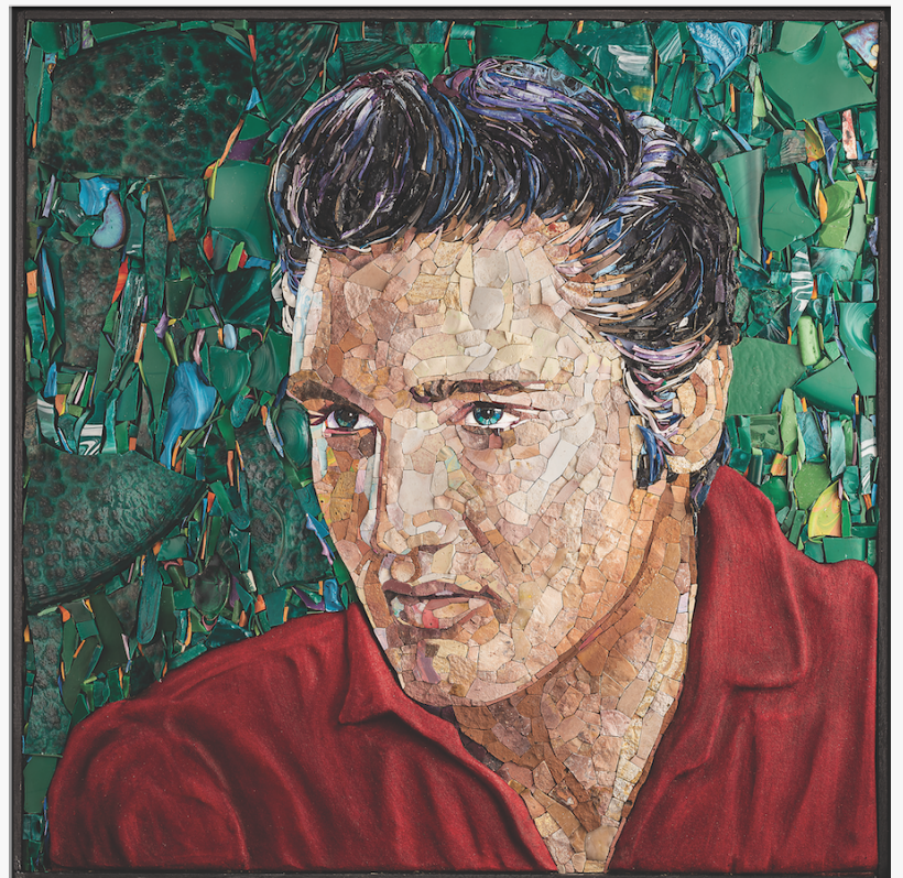
Elvis - Mosaics at Cornell Art Museum