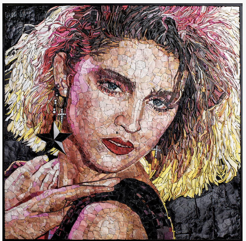
Madonna - Mosaics at Cornell Art Museum

Blume. Learn more at https://delrayoldschoolsquare.com/about .