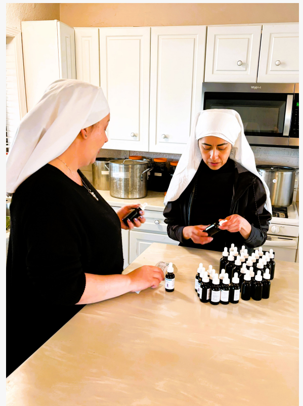
Sisters at Work Together