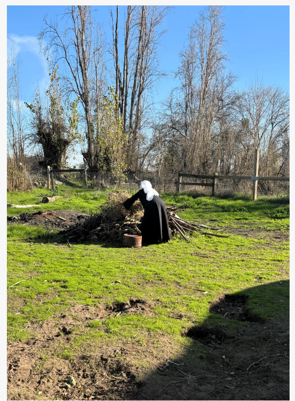
Preparing for the First Fire Circle of the New Year