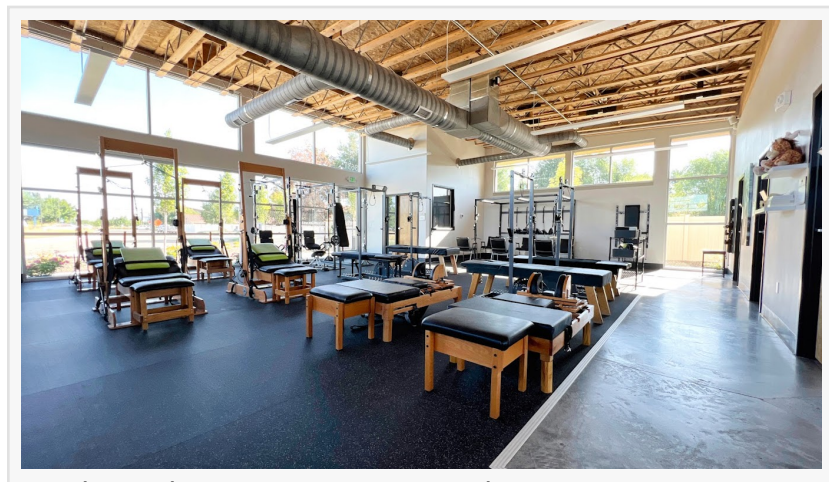
Modern Chiropractic Center Indoor

Chiropractic BioPhysics® Nonprofit (CBP® Nonprofit) is a globally recognized organization committed to advancing chiropractic care through rigorous scientific research, practitioner education, and public outreach. Founded on the principles of evidence-based practice, CBP® Nonprofit develops and promotes chiropractic methodologies that prioritize spinal alignment and overall health. The organization's mission is to enhance the credibility and efficacy of chiropractic care while fostering a deeper understanding of its role in holistic health.