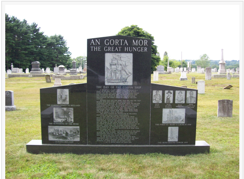
"An Gorta Mor" The Hunger Death