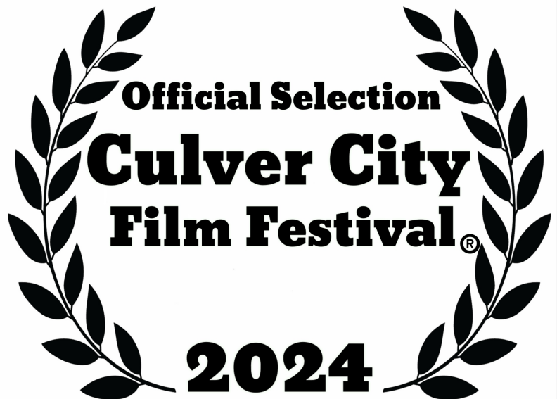
Culver City Film Festival Official Selection Laurel 2024

Submissions for the 2025 film festival are open on Film Freeway