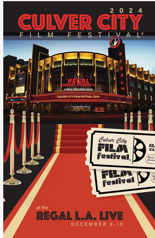
Culver City Film Festival 2024 Program Cover