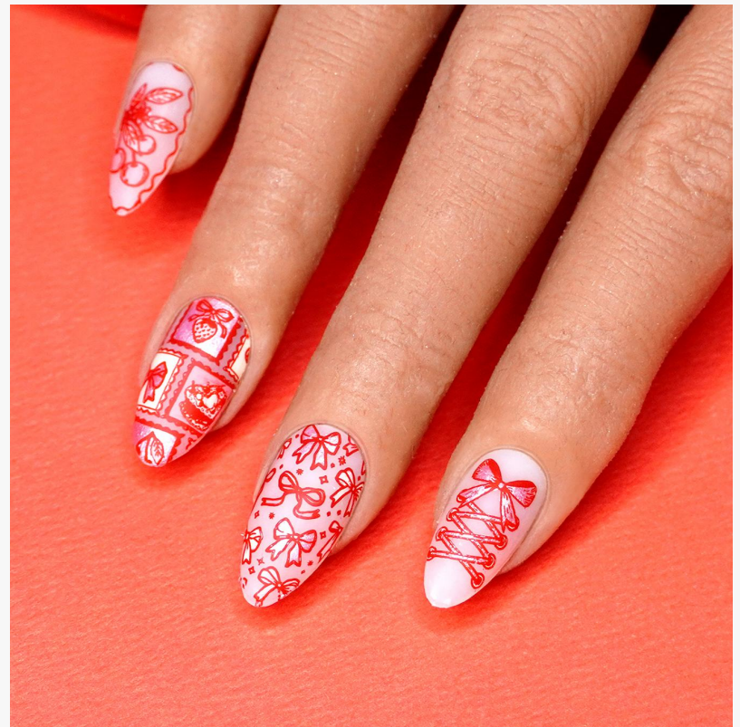
The Mani X Me Box for January 2025 is inspired by the coquette aesthetic, which is currently trending on TikTok.

The first nail stamping plate included in this month's Mani X Me box is the MXM143 stamping