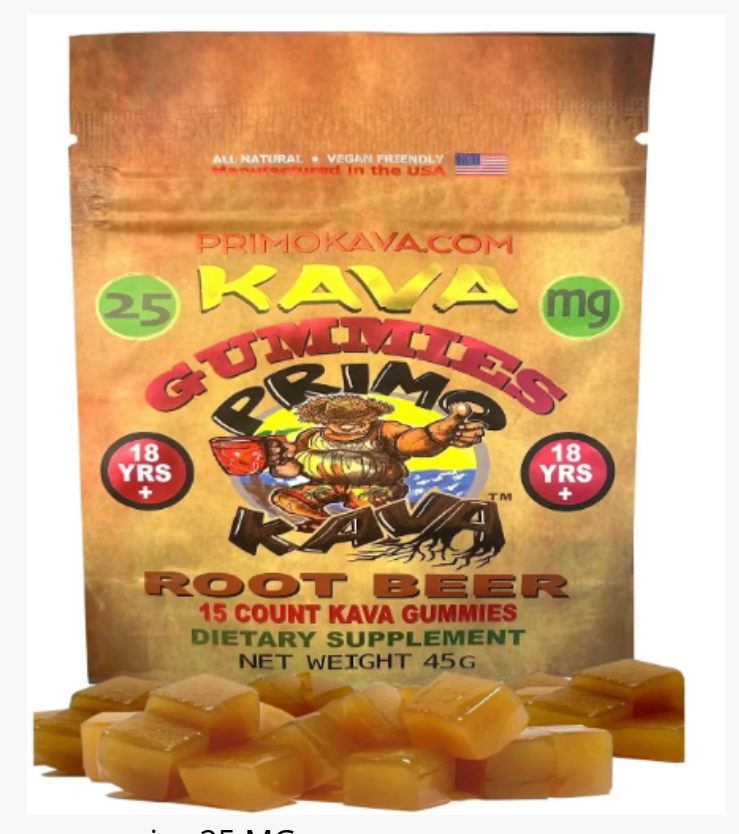
kava gummies 25 MG

is significant not only for its size but for what it represents in terms of advancements in kava