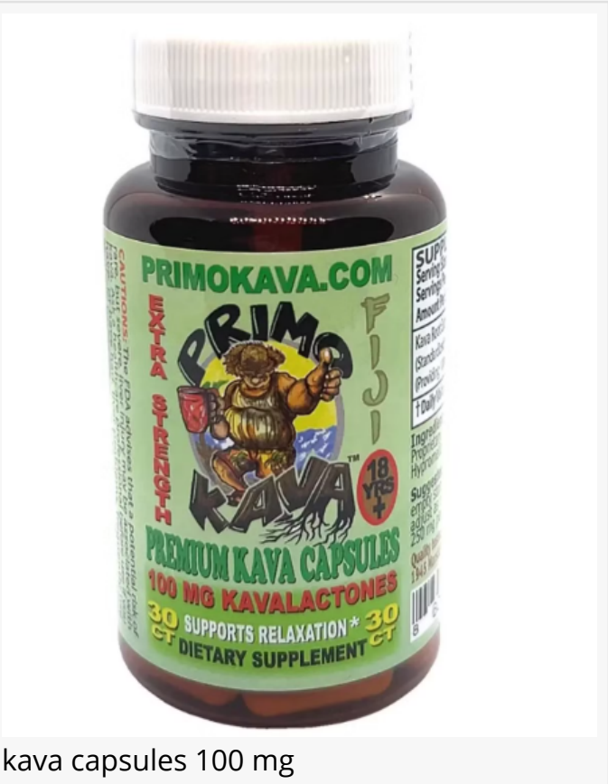
kava capsules 100 mg

Implications for the Kava Industry This discovery also underscores the potential for improved farming practices to shape the future of kava production. It may inspire further research into optimizing cultivation methods, preserving the environmental health of the Pacific Islands, and increasing the yields of premium kava roots. The broader industry could see significant benefits from the adoption of these practices, leading to more consistent and high-quality products reaching the market.