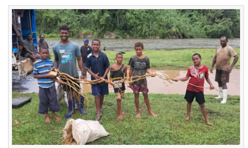
kava longest root