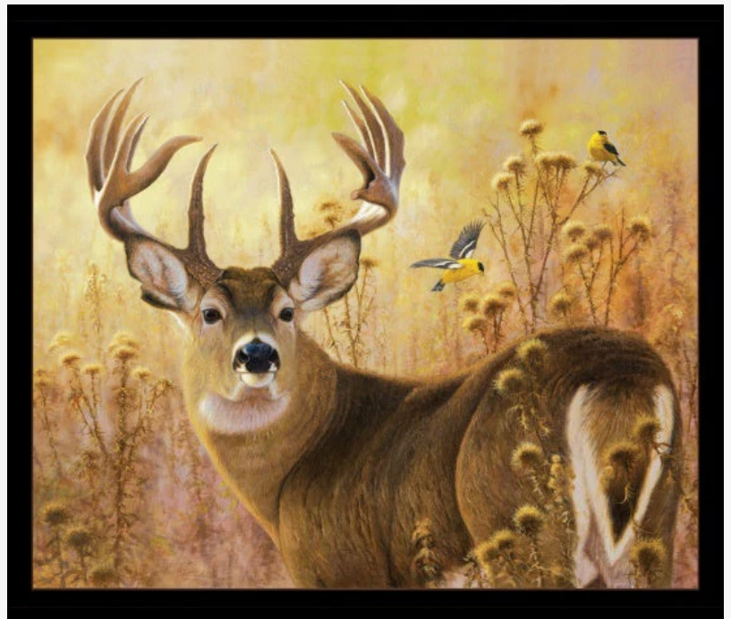
Floral patterns for sale-