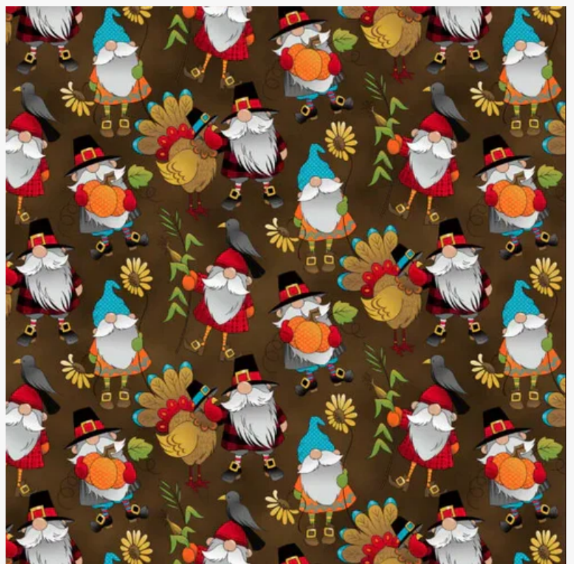
Novelty Fabric by the yard-

Materials that support sustainability and eco-conscious projects are gaining prominence, reflecting consumer interest in reducing environmental impact. Additionally, innovations in textile manufacturing have introduced fabrics with enhanced durability, flexibility, and visual appeal, expanding the possibilities for creators.