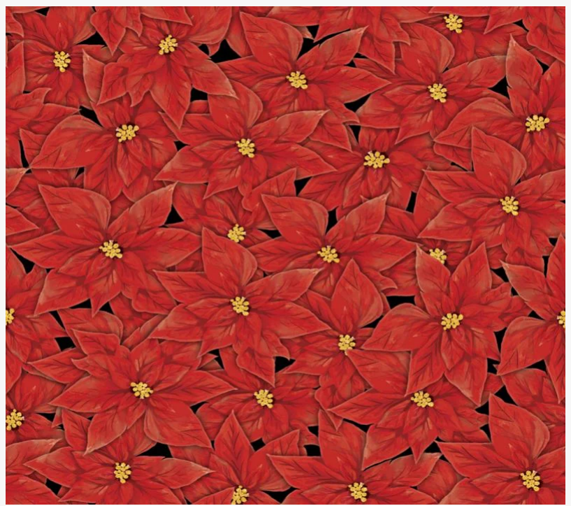
David textiles fabric-

The broader industry has also observed a shift in consumer expectations regarding fabric quality. As the global market becomes increasingly competitive, retailers are prioritizing partnerships with suppliers that meet rigorous production standards. This ensures that fabrics maintain their durability and aesthetic appeal, key considerations for both hobbyists and