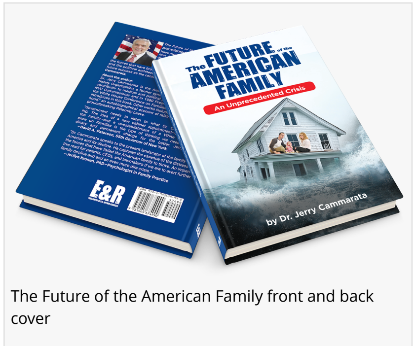
The Future of the American Family front and back cover