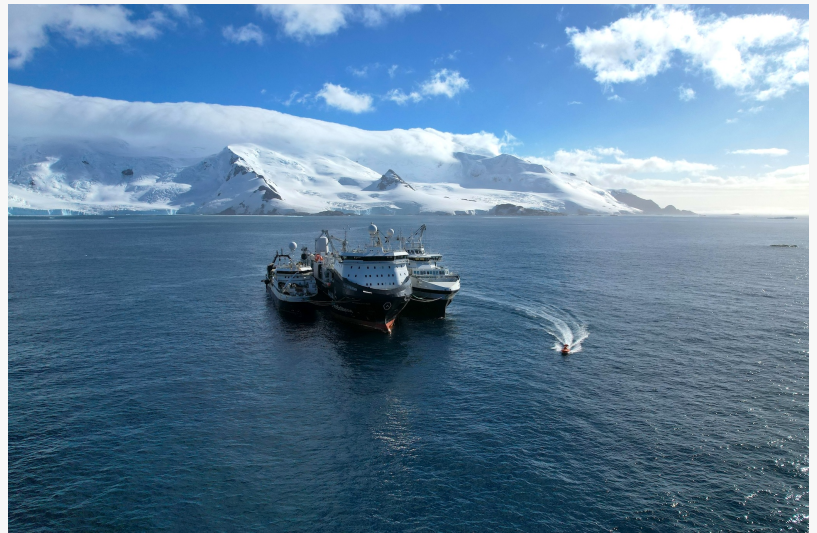
Aker QRILL Company fleet and vessels