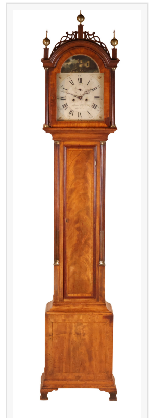
Federal brass-mounted inlaid mahogany tall-case clock, signed Aaron Willard (Massachusetts), circa 1800-1820. Estimate: $10,000-$20,000.

Perhaps the most well-known of Mid-Century Modern designs, the Eames Lounge Chair and Ottoman has been a symbol of luxurious comfort since it was introduced in 1956. Designed by Charles and Ray Eames for Herman Miller, this chair remains an enduring favorite for design aficionados around the world. With its sumptuous, molded plywood shell, plush leather cushions, and fluid, organic form, the Eames Lounge Chair exudes comfort and sophistication, making it the ideal blend of form and function.