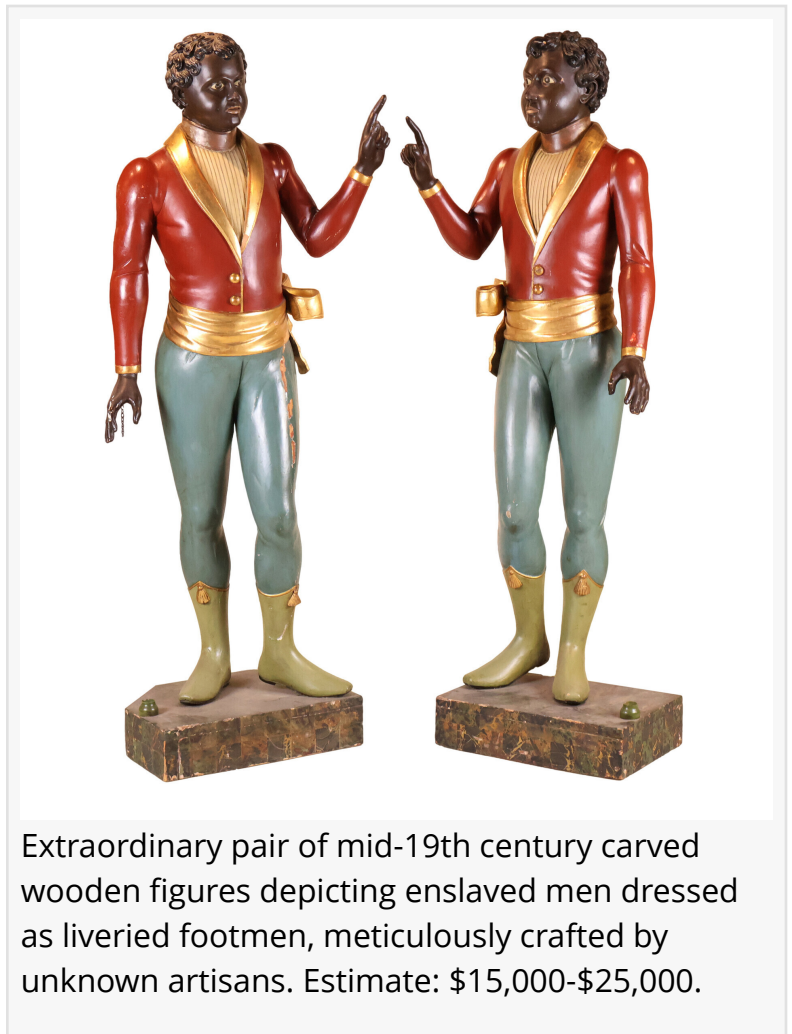
Extraordinary pair of mid-19th century carved wooden figures depicting enslaved men dressed as liveried footmen, meticulously crafted by unknown artisans. Estimate: $15,000-$25,000.

The Fraunces Tavern Museum, one of New York City's oldest and most storied landmarks, has announced the approval to deaccession a selection of its portrait paintings and contemporary