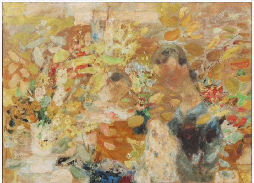
Striking painting by Le Pho (1907-2001), the esteemed Vietnamese and French artist, titled Mother and Child, Le Couture, oil on silk laid on board. Estimate: $40,000-$60,000.