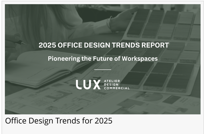
Office Design Trends for 2025

OTTERBURN PARK, QUEBEC, CANADA, January 8, 2025 /EINPresswire.com/ -- As businesses prepare for 2025, Atelier Lux Design, a leader in innovative office design solutions, proudly announces the release of the 2025 Office Design Trends Report. This comprehensive resource highlights the key trends shaping the future of workplaces, offering actionable insights for companies looking to adapt their environments to align with evolving employee needs, technological advancements, and sustainability goals.