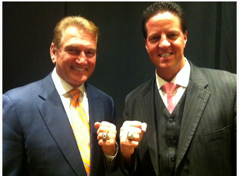
James Malinchak Interviewed by Joe Theismann

This press release can be viewed online at: https://www.einpresswire.com/article/775231112