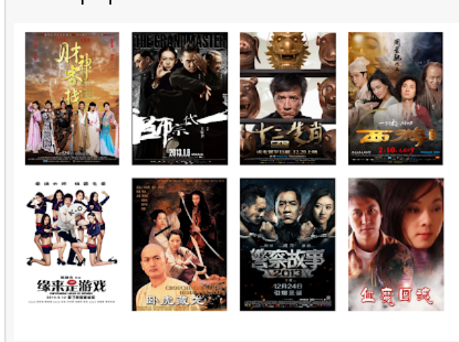
Previous projects of Shinshot's core team

China, where it holds access to over 80,000 screens, Shinshot Media has established itself as a