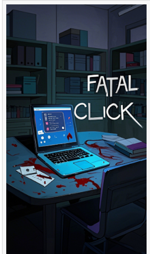
Concept poster of Fatal Click

Shinshot Media Inc. brings significant experience to this project, having already produced and financed a range of successful films with broad international appeal. With a $50 million film fund dedicated to investment, production and distribution, and a reach that spans across three