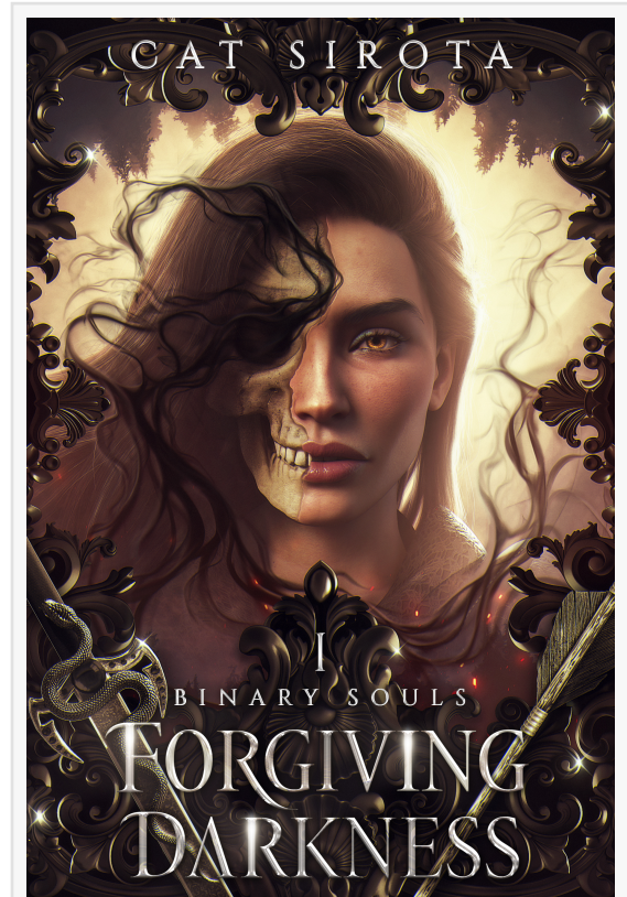
Forgiven Darkness Cover Design by Miblant

Stephanie Skiffington exclaims, "Absolutely amazing!" — 5 out of 5 stars