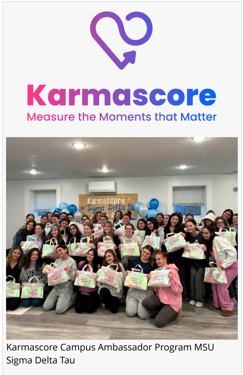
Karmascore Campus Ambassador Program MSU Sigma Delta Tau

Karmascore positions itself as a sophisticated relationship management tool beyond traditional apps, helping users cultivate healthier, more rewarding relationships. Its platform supports various needs, from family, dating, and friendships to academic and professional relationships. The app also aims to empower users to identify and overcome negative patterns, enhancing emotional well-being.