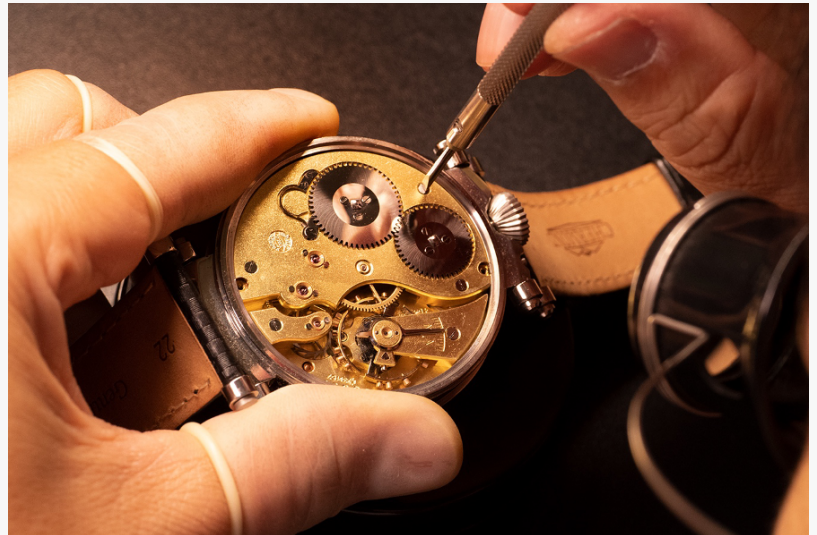
The Online Watch Academy

□□□Watch Repair Basics: This course will teach you the basic skills needed to repair mechanical watches.