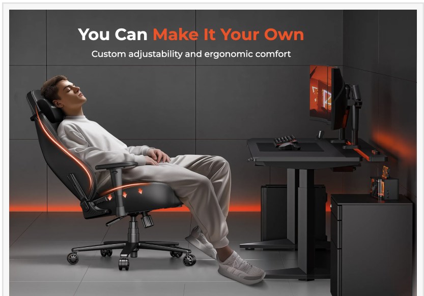
Novis Series AndaSeat 2025

This strategic expansion into the entry-level market raises questions about AndaSeat's long-term vision and its evolving position within the gaming furniture industry. While the company has not signaled any intention to abandon its established presence in the mid-range and premium segments, the launch of the Novis Series suggests a broader ambition to become a more comprehensive player across the entire gaming chair market.