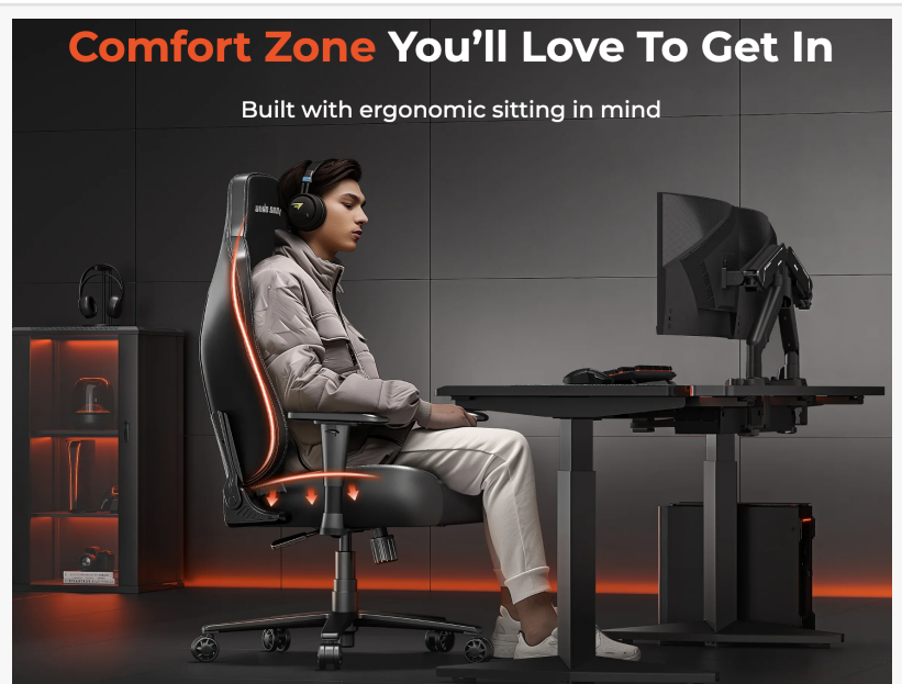
Novis Series AndaSeat

AndaSeat's decision to enter the entry-level market is a calculated response to evolving dynamics within the gaming furniture sector. While the company has enjoyed success in higher price brackets, recent market analysis has indicated a growing demand for more accessible seating options that do not compromise on essential ergonomic features. This expansion reflects a broader trend of increasing consumer awareness regarding the importance of ergonomics, even at lower price points.