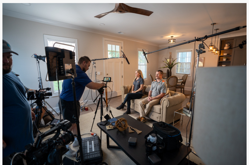
Lights, camera, action! Splash Omnimedia brings Easy Electric's story to life behind the scenes.

COLUMBIA, SC, UNITED STATES, January 9, 2025 /EINPresswire.com/ -- Easy Electric is proud to announce the launch of its enhanced website , created in partnership with Splash Omnimedia. Designed to provide an intuitive and informative user experience, the platform offers clients seamless access to electrical service information, an interactive diagnostic tool, and an easy appointment request system. These features aim to simplify the service process and empower clients to make informed decisions about their electrical needs.