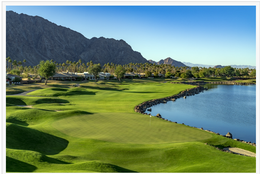
Hole 18 at PGA WEST

ABOUT AMERICAN EXPRESS American Express is a globally integrated payments company, providing customers with access to products, insights and experiences that enrich lives and build business success.