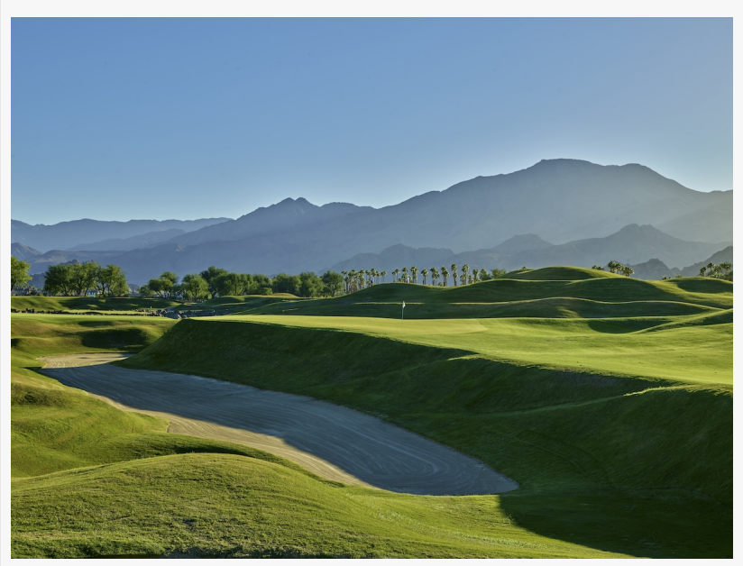
Hole 16 at PGA WEST

Learn more at americanexpress.com and connect with us on facebook.com/americanexpress, instagram.com/americanexpress, linkedin.com/company/american-express, twitter.com/americanexpress, and youtube.com/americanexpress.