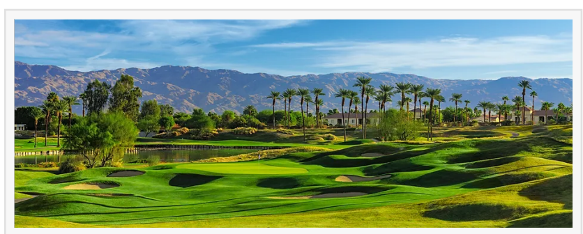
Extensive greens restoration project at PGA WEST

LA QUINTA, CA, UNITED STATES, January 9, 2025 /EINPresswire.com/ --Significant upgrades and course enhancements have been made at <u>PGA</u> <u>WEST</u> in preparation for the 66th annual <u>The American Express</u><sup>®</sup> golf tournament, being held January 16th-19th in La Quinta, CA.