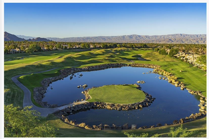
The 17th green "Alcatraz" at PGA WEST was restored to its original level.

both challenging and enjoyable, all while paying homage to Pete Dye's original vision."