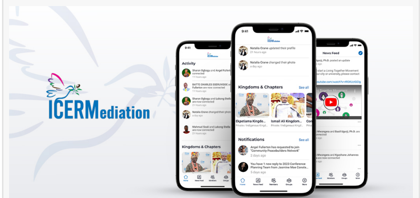
ICERMediation - Preserving Global Cultures