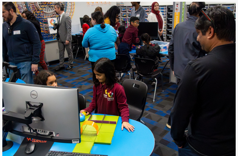
TMSA Cary Students working on SmartLab Project Starter