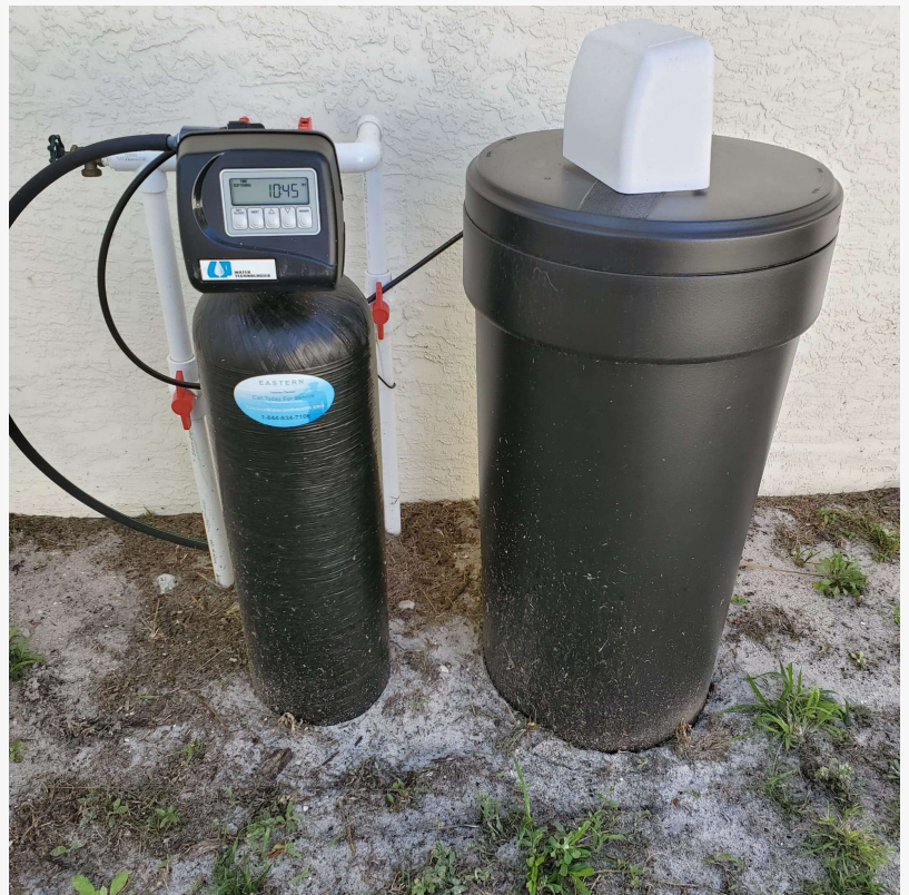
Testing for PFAS in Water.