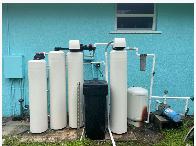
Water Softener Installation Services

By leveraging the expertise of water treatment professionals, investing in advanced monitoring and control systems, and exploring innovative disinfection technologies, the utility, and the local water treatment provider are setting a new benchmark for water quality excellence in the state of Florida.