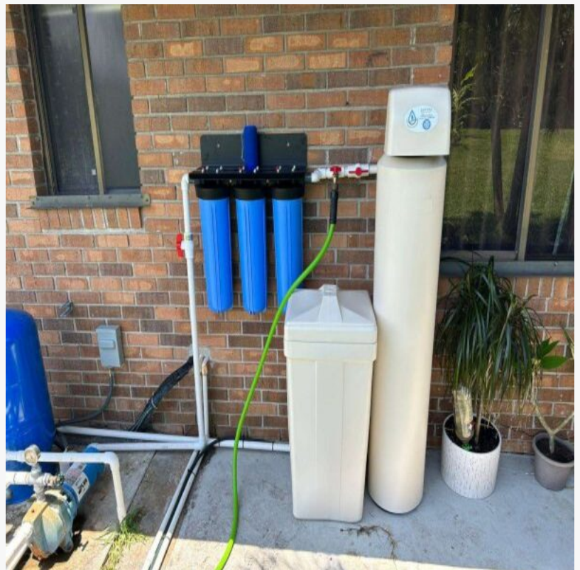
Whole House Water Treatment