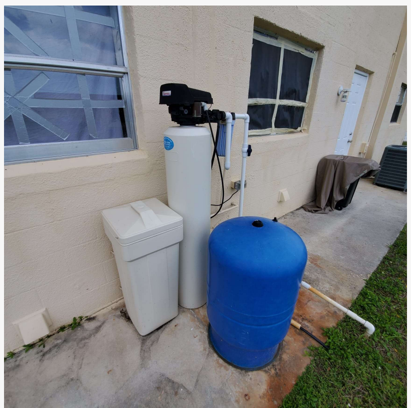
Emergency Repair Services

1. Whole-House Water Filtration: PSL Water Guy's advanced whole-house water filtration systems remove a wide range of contaminants, providing clean, safe water for all household