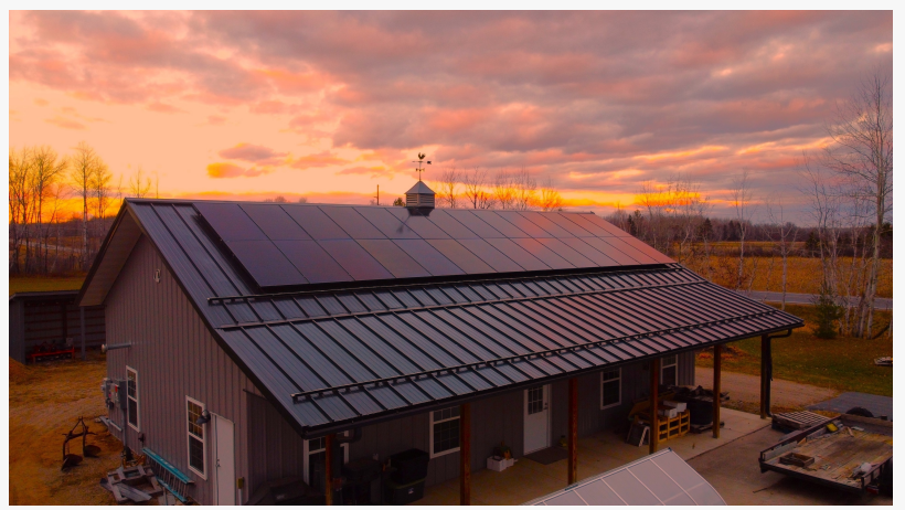
Wolf River Electric Sunset Solar