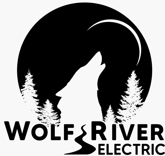
Wolf River Electric Logo