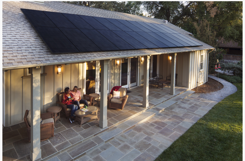
Equinox Solar Array