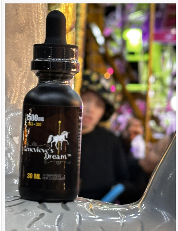
The GCRC Founder wants his daughters dream of owning a large carousel to come true