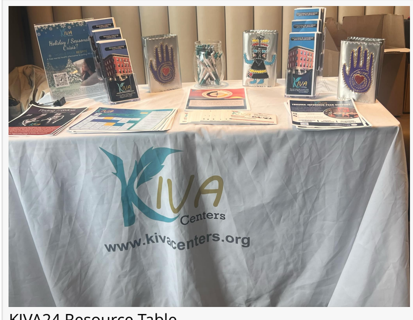
KIVA24 Resource Table

Training for the Winter cohort begins Monday, January 20, 2025 and will bring together a class of high character, community driven people that will make a difference. An identical session for Springfield, MA will join them late Spring of 2025.