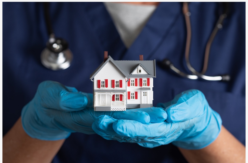
Nevada Nurse Next Door Home Buying Grants