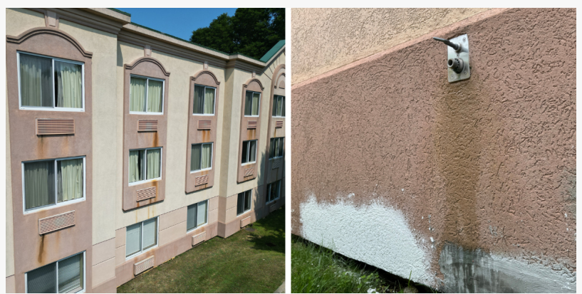
Previous Cosmetic and water damage on the exterior stucco of the hotel