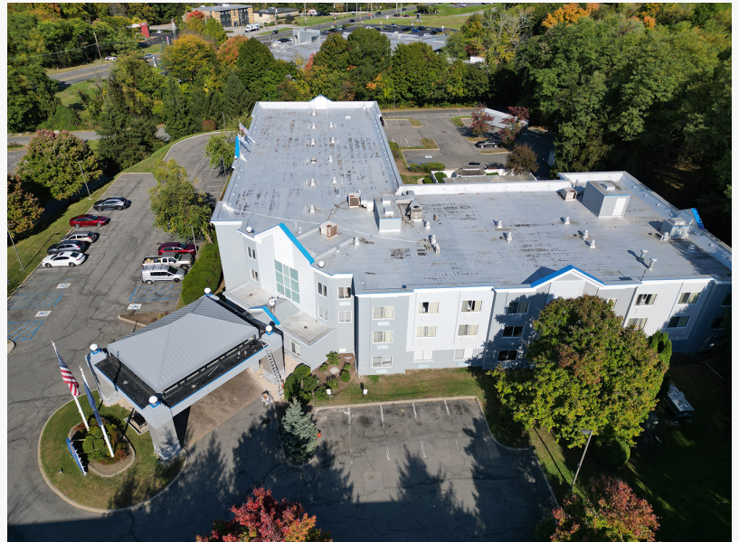
Full exterior view of the completed project