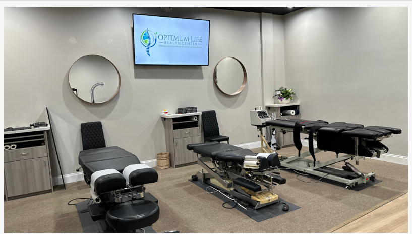
Optimum Life Interior

“The support and enthusiasm we’ve received from the community have been heartwarming. Patients are excited to experience care that truly goes beyond the norm, and we’re grateful to