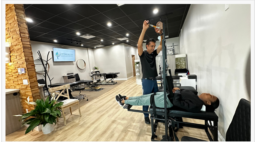
Corrective Spinal Traction - Optimum Life Health Center

This press release can be viewed online at: https://www.einpresswire.com/article/775905561