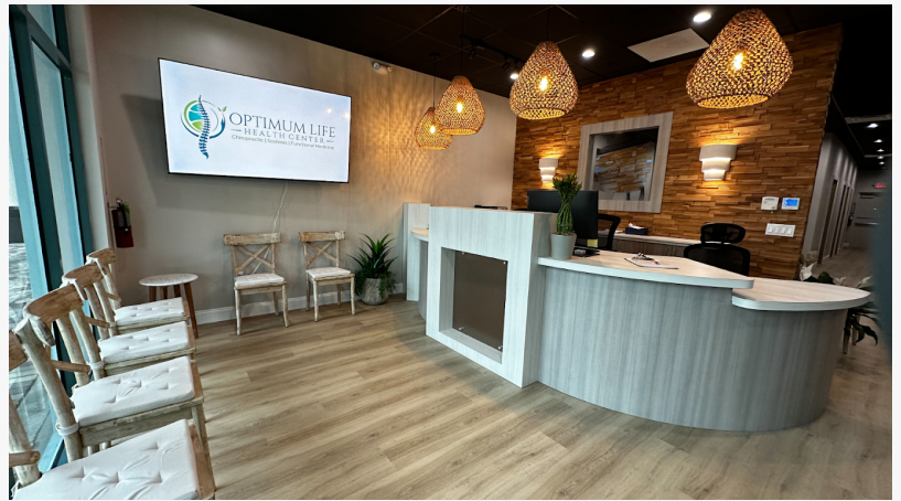
Optimum Life Interior Front Desk