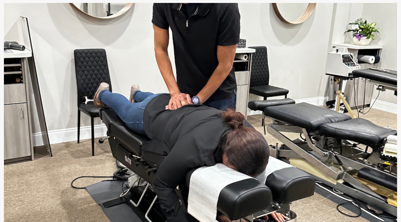
Chiropractic Adjustment - Optimum Life Health Center