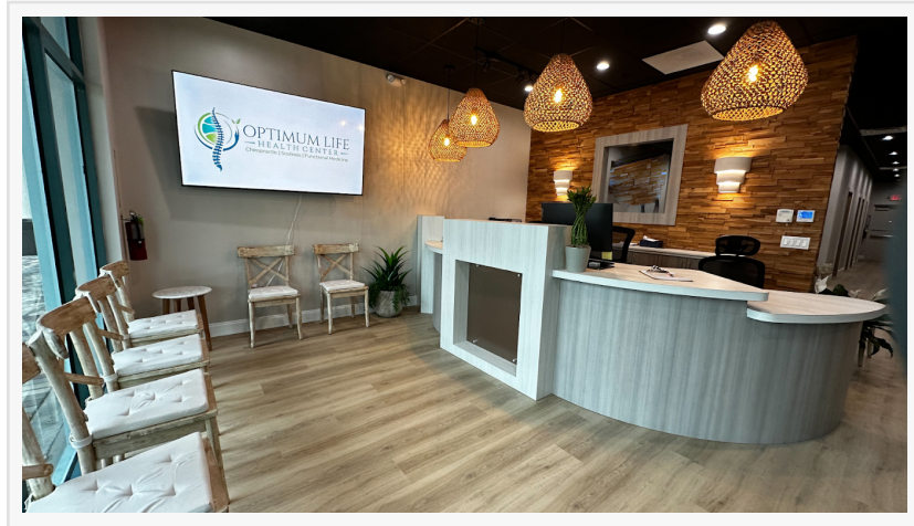
Optimum Life Interior Front Desk

The clinic is deeply committed to raising awareness about scoliosis through outreach programs in local schools and organizations. Parents who have endured invasive back surgeries are especially grateful for the opportunity to prevent similar experiences for their children.