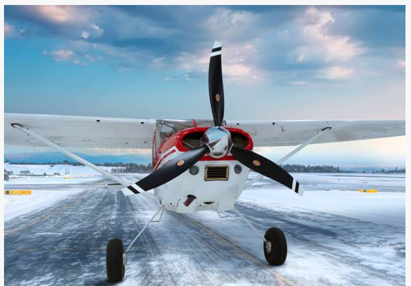
Hartzell Propeller Carbon Voyager

The advanced carbon fiber composite propellers are now available for Cessna 180, 182, 185, 206, and T206 single-engine aircraft equipped with Continental 470-50, 520, and 550 engines. Propeller diameters range from 80 to 86 inches, depending on the application.