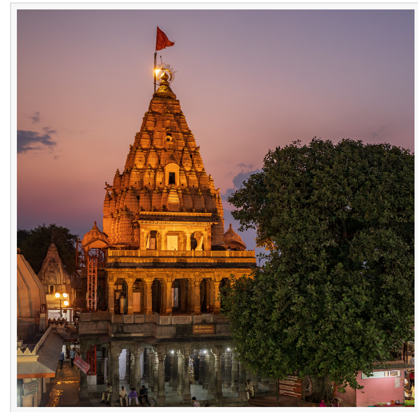
Shri Mahakaleshwar Jyotirlinga Temple, Ujjain

Madhya Pradesh's focus on spiritual circuits provides travelers with opportunities for both physical and spiritual rejuvenation, fostering mindfulness and reflection. The state has witnessed a remarkable rise in tourism, with a record-breaking 112.1 million visitors in 2023, a testament to its growing appeal as a multifaceted destination. Spiritual tourism continues to be a vital part of this