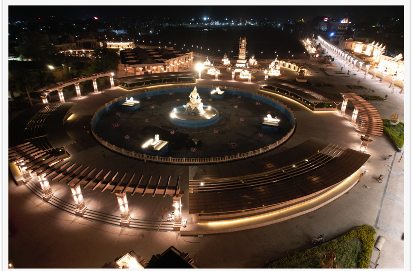
Mahakal Lok Corridor, Ujjain

This press release can be viewed online at: https://www.einpresswire.com/article/776110599