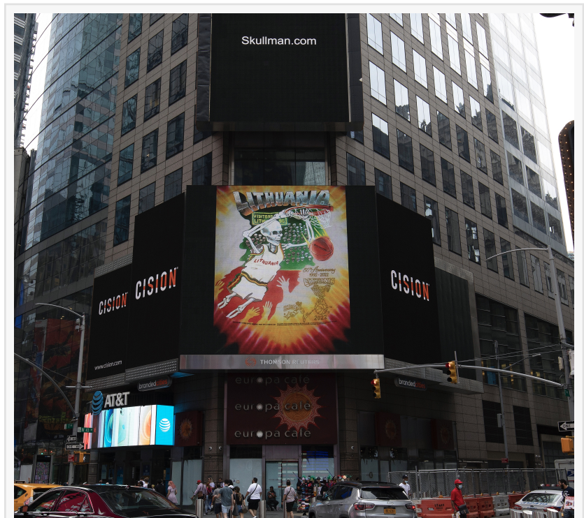
The Lithuania Tie Dye® Slam Dunking Skeleton Jerseys Brand was unveiled once before in the "Center of the World" in Times Square, N.Y.C. when it celebrated it's Milestone 30th Anniversary in 2022.

https://www.amworldgroup.com/blog/lithuanian-slam-dunking-skeleton-back-for-the-other-dream-team-documentary