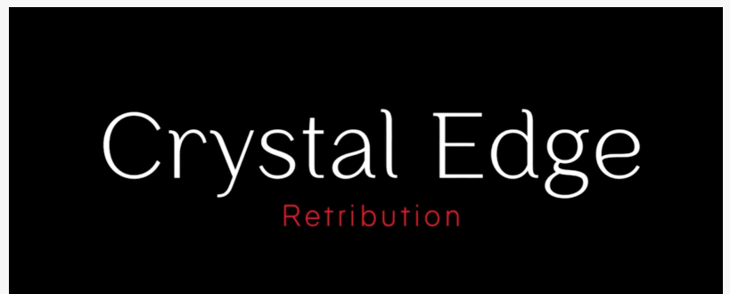
Crystal Edge Game Logo