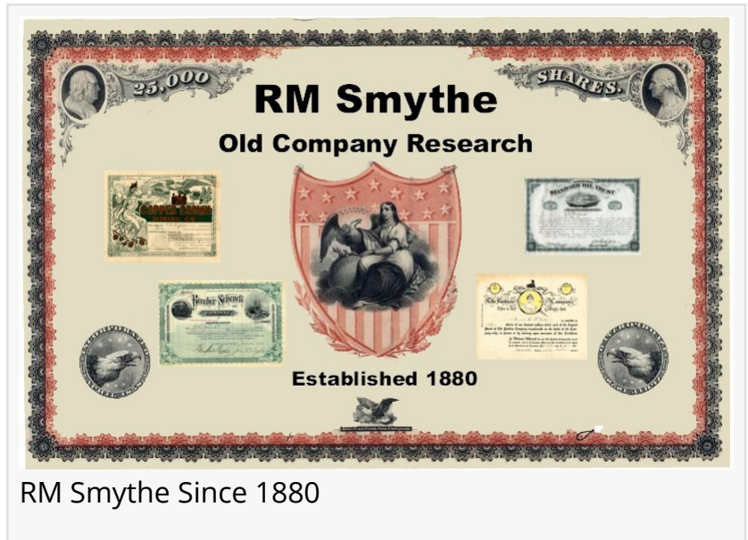
RM Smythe Since 1880

Member Breakfast 7:45 AM on Saturday Feb 1st