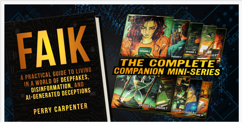
The FAIK Files Audio Miniseries