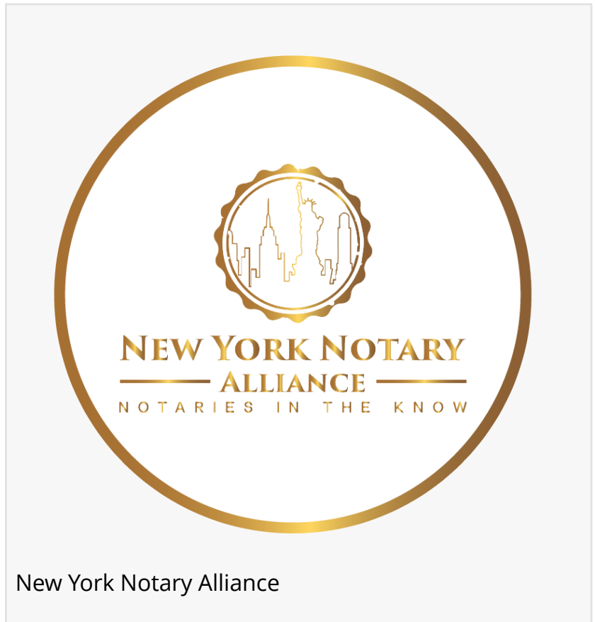
New York Notary Alliance