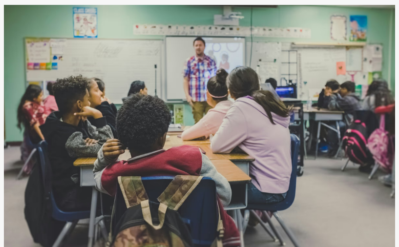
Teacher using EssayGrader in the classroom

EssayGrader , the world's #1 AI Essay Grading Platform, announced the release of EssayGrader 2.5, a game-changing update designed to streamline grading workflows, empower teachers and support their well-being. This latest version includes cutting-edge features that not only save time but also keep educators in full control of the grading process, all while maintaining the highest standards of privacy compliance.