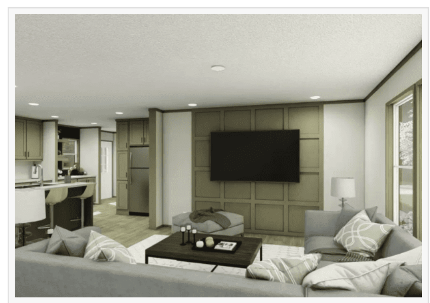
Manufactured Housing Consultants Offer Deals for Mobile Homes in Texas

NEW BRAUNFELS, TX, UNITED STATES, January 15, 2025 /EINPresswire.com/ -- At the heart of Texas, Manufactured Housing Consultants (MHC) is leading the charge in making homeownership more accessible and affordable with their extensive inventory of bank repossessed mobile homes. These properties offer a prime opportunity for individuals and families in New Braunfels and beyond to own quality homes without breaking the bank.