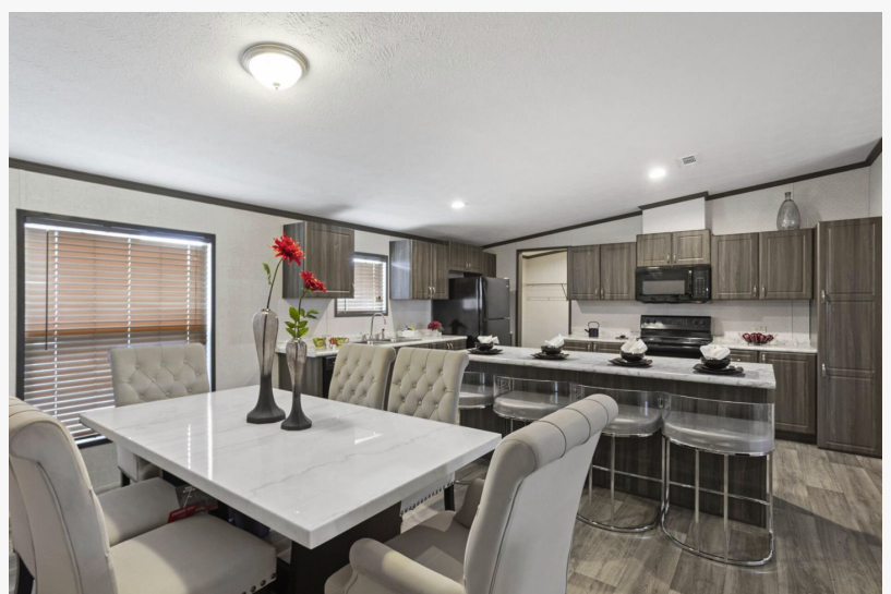
MHC Laredo offers new financing options for mobile homes

LAREDO, TX, UNITED STATES, January 15, 2025 /EINPresswire.com/ -- Manufactured Housing Consultants announces an extensive selection of affordable repo mobile homes in Laredo , providing unique opportunities to own high-quality homes at a fraction of the cost. This initiative reinforces the company's commitment to making homeownership accessible and affordable.