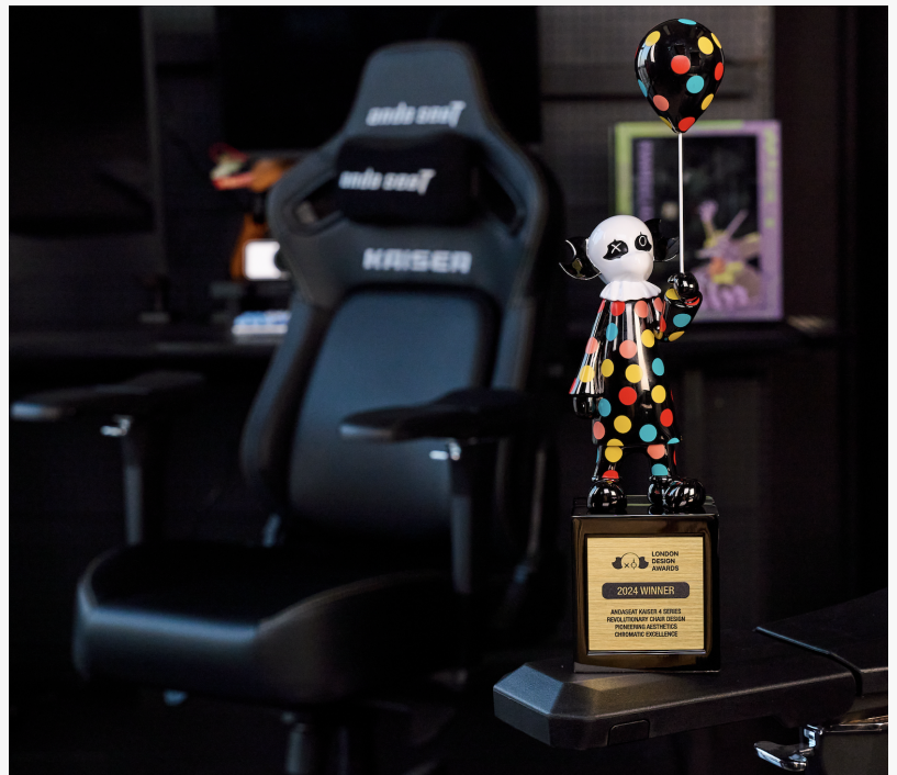
Kaiser 4 London Design Awards 2024

AndaSeat , a leader in ergonomic furniture innovation, has been named a Golden Winner in the Furniture Category at the prestigious London Design Awards 2024. This accolade recognizes the company's ongoing commitment to pushing the boundaries of design and innovation within the global furniture industry. The award highlights AndaSeat's ability to blend functionality, aesthetics, and sustainability, marking a significant milestone in the company's journey.