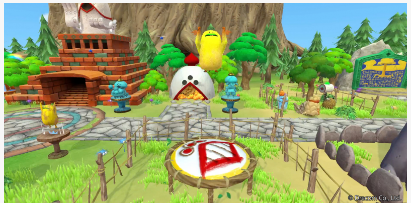
Improve Meems’ lives