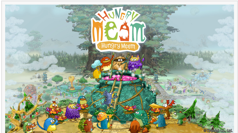
Hungry Meem _KV

For more details of the Nintendo Switch™ version, see the CLE Official Site ( https://www.cloudedleopardent.com/ )