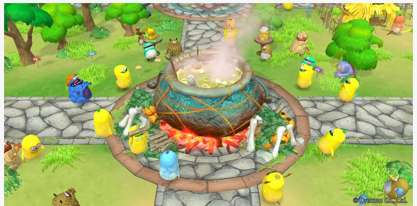
Meems that love to eat, sleep and play!