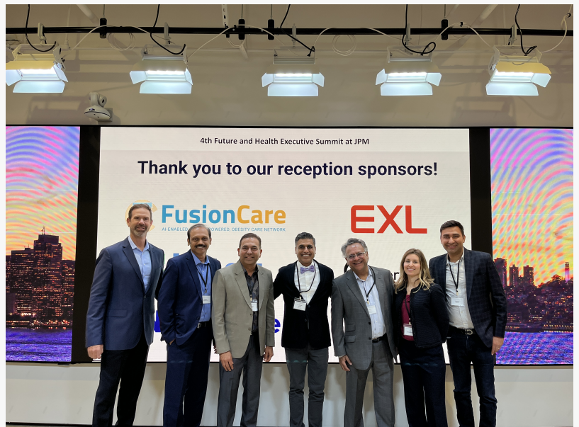
FusionCare.AI Team at JPM Conference 2025